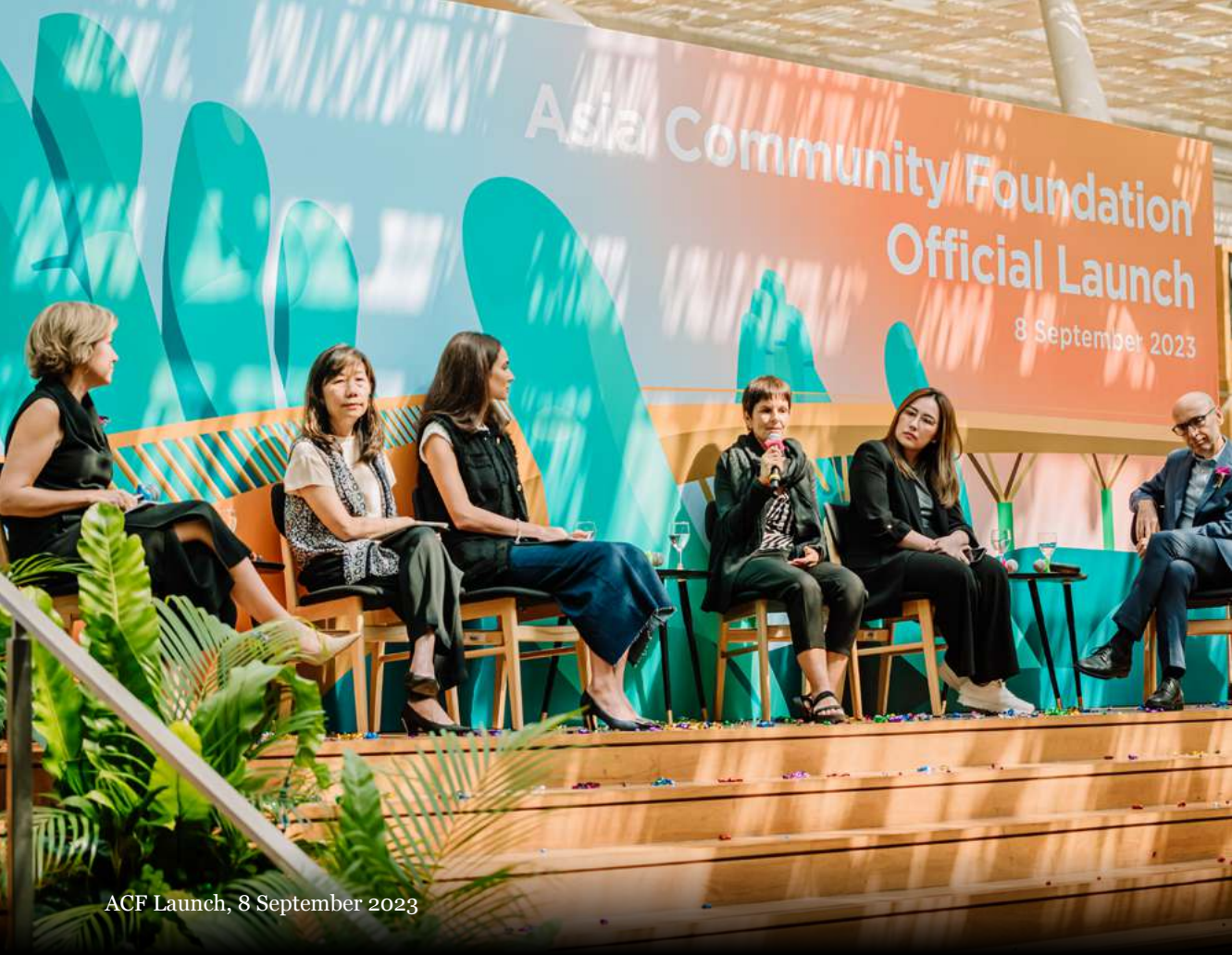
ACF Launch, 8 September 2023

community of donors. Whether you are a seasoned giver or exploring philanthropy for the first time, ACF offers a space to learn and grow together. By developing tech-enabled platforms and rolling out thematic impact funds championed by experienced donors, we aim to foster collaborative giving and create greater collective impact.