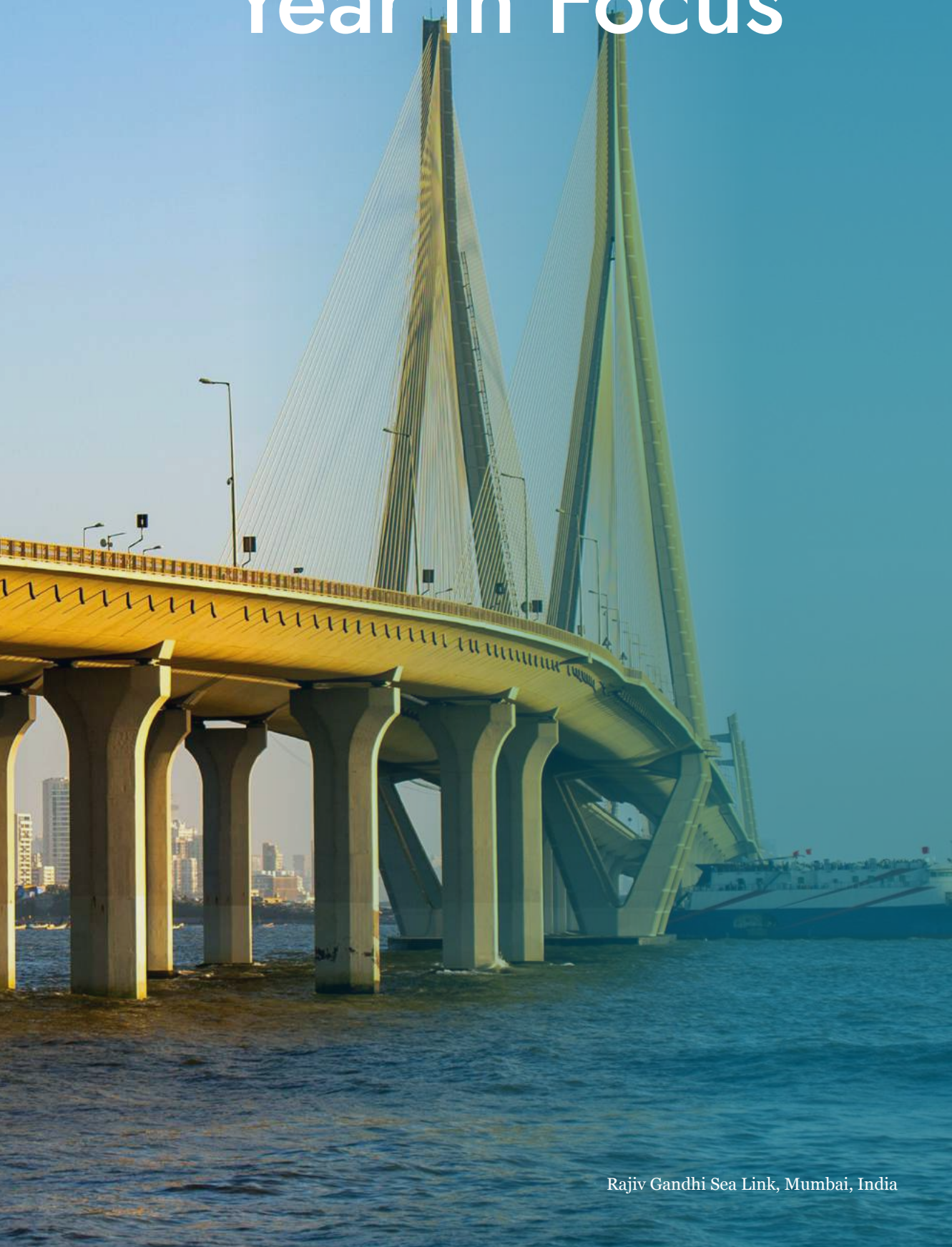
Rajiv Gandhi Sea Link, Mumbai, India